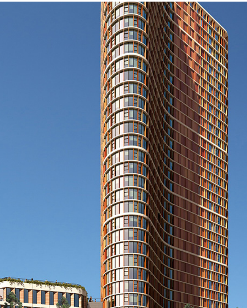
Boomerang Tower 229 apartments, 39 storeys

Architect: Bates Smart Client: Ecove Group Builder: Taylor