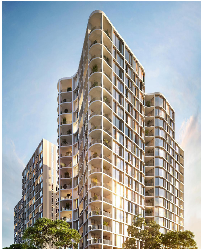
Park One Apartments 409 apartments with associated ground level retail

Architect: Bates Smart Client: Ecove Group Builder: Taylor