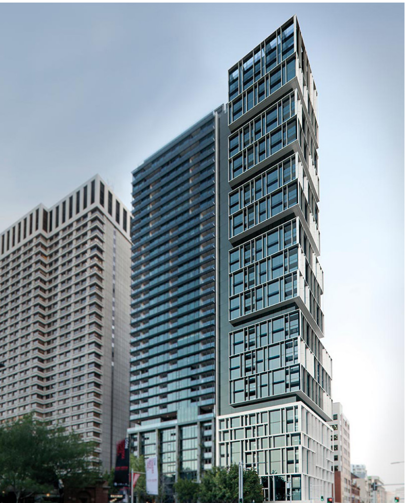
One30 Hyde Park