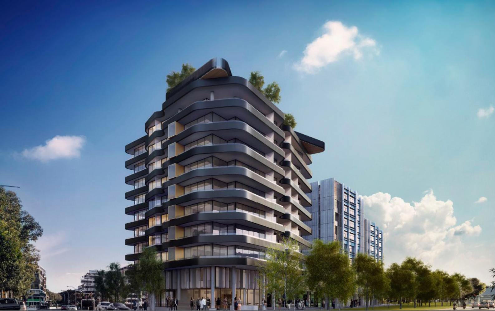
No1 Lachlan Street Waterloo (high rise residential) 143 residencies, Three retail tenancies, Childcare centre